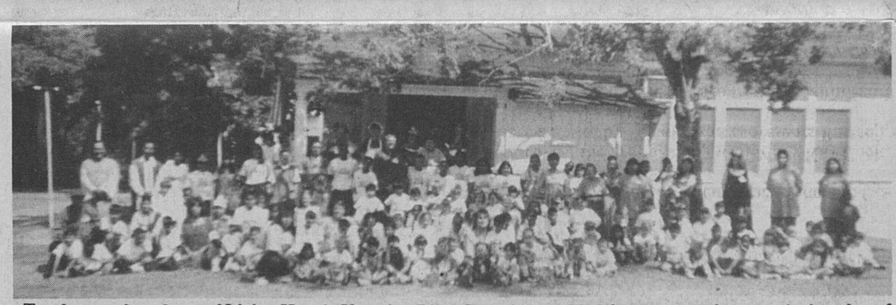
Teachers and students of Living Hope's Vacation Bible School assembled for a group photo on the last day of week-long session in June.

the Extension, visited Representative Cook's office and attended a program at the Visitor's Center.